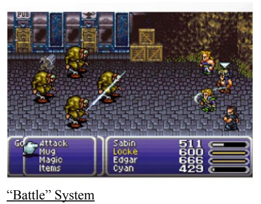
Player character will "battle" with customers by selecting different learned OC skills

These "battles" will give the player a chance to see how the skills they've learned can be applied to a workplace. With each correct skill or phrase selection, the customer will gain something similar to hit-points so that the player can see the positive effects of their effective communication displayed on screen. Negative selections will result in the customer receiving negative hit-points and the "battle" will continue. Once the player has selected enough positive examples of OC to use on the customer the battle will be over and the player can move on to speak with more NPCs, gain more skills, and engage the next customer.